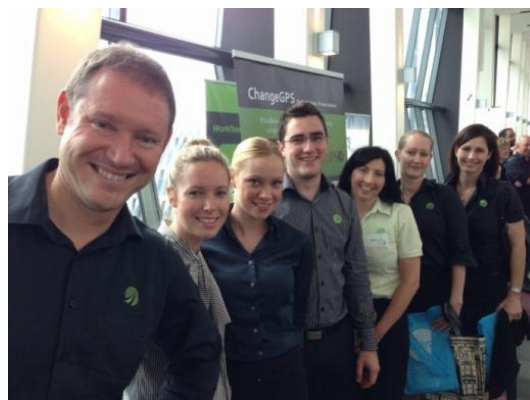
ChangeGPS (Brisbane, QLD)