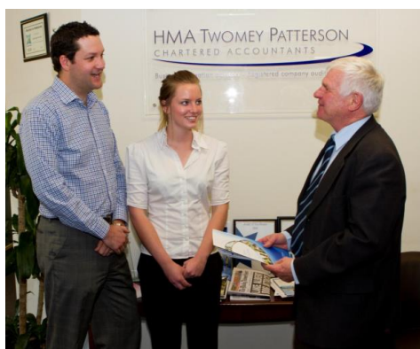
Twomeys (Regional Southern NSW)