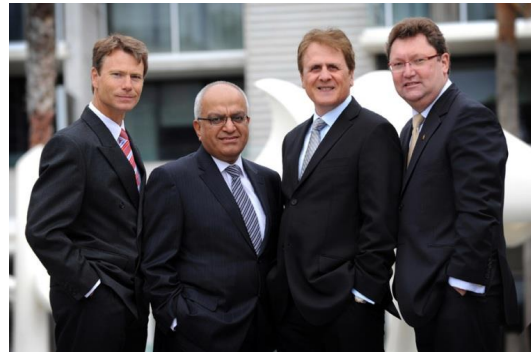
Kidmans (Melbourne, VIC)