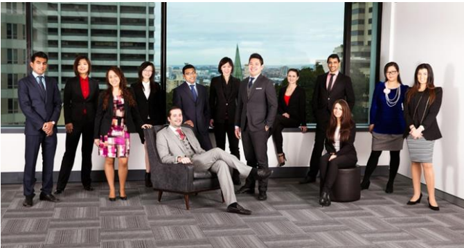
My Accounts (Brisbane, QLD & Sydney, NSW)